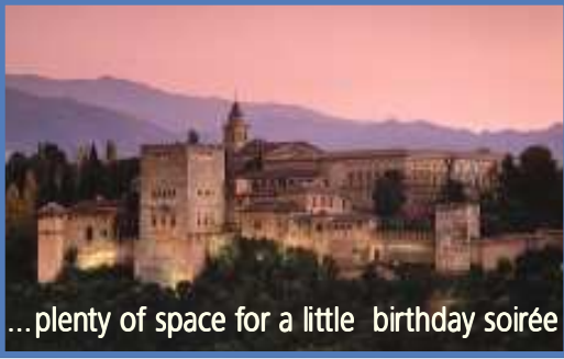
...plenty of space for a little birthday soirée

cinnamon-scented mouths under those veils.